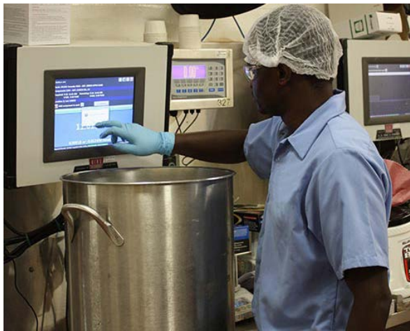
Traditional Batching Method

An automated batching system can improve product quality and increase efficiency and throughput. However, the complexity and commitment required by many batching applications often makes the decision to switch from a manual to automated system a difficult one.