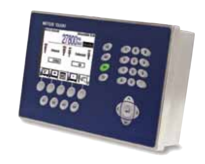
Optional IND780 scale terminal