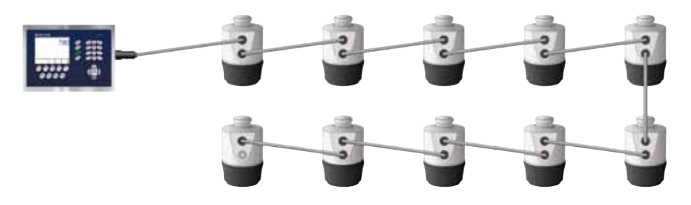
POWERCELL® PDX® Digital Load Cell Network (No Junction Boxes) Load cells and cables are watertight

POWERCELL® PDX® load cells have revolutionized vehicle weighing. With their unique design, they eliminate the weak link in any vehicle scale: the junction box. This simple improvement pays off with lower maintenance bills and less downtime.