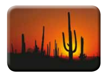
Extreme Temperatures Digital compensation maintains accuracy in all climates.