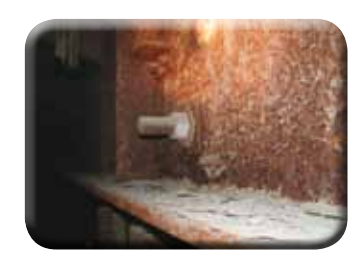
Rust and Corrosion Heavy-duty stainless steel enclosure resists corrosion.