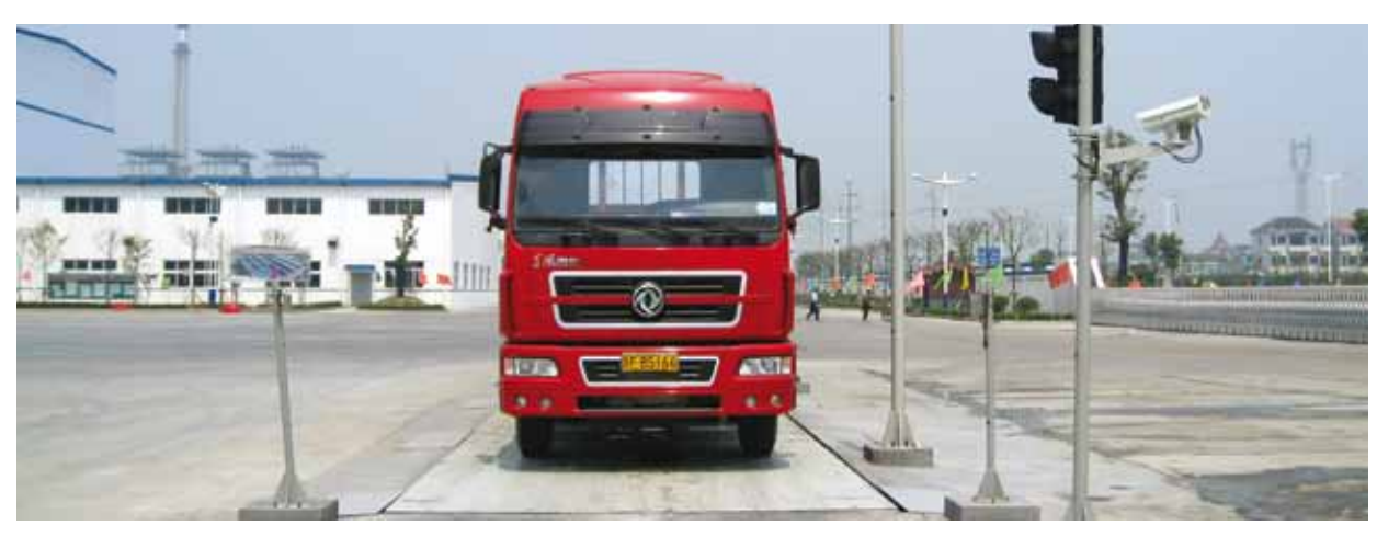
POWERCELL® GDD® load cells use advanced digital technology to provide accurate vehicle weighing at an economical price.