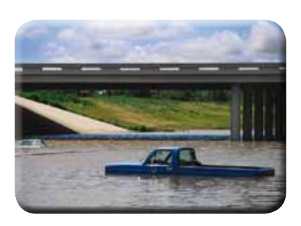
POWERCELL® PDX® load cells passed tests for high-pressure spraying and water submersion.