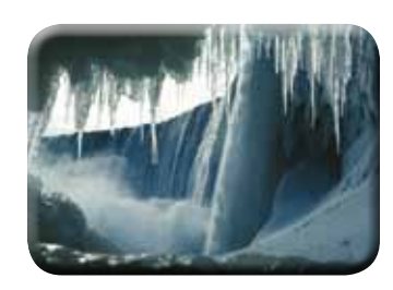
Snow and Ice Rubber boot protects against errors caused by built-up material.