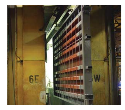
Metal surfaces are coated with a two-part epoxy finish to protect against corrosion.

Our six-step product development process is the most comprehensive design, analysis, and testing program in the industry. It delivers scales with the proven ability to meet the demands of your weighing application. No other manufacturer designs and tests truck scales this thoroughly.