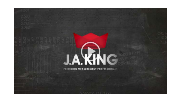
<u>Watch our chalk talk</u> to learn more about J.A. King's comprehensive torque measurement solutions.

J.A. King can help ensure you're using the proper tool for your particular torque application, and we provide repair and the ISO 17025 accredited torque calibration services you need to ensure your tools are as accurate as possible.