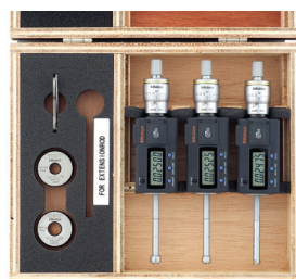
Complete-Unit Set: 468-986