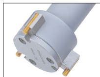
TiN coated contact points

An extension tube (optional accessory) can be fitted to enable measurement of deep holes.