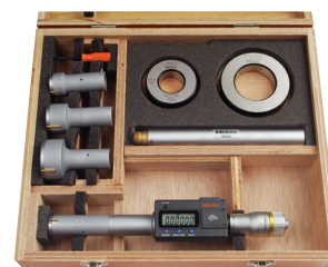
Interchangeable-Head Set: 468-978